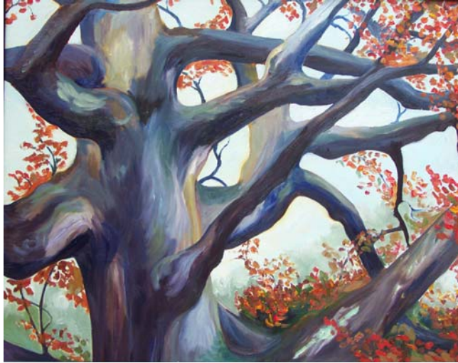
"Penn Oak at London Grove" oil on canvas 24x30